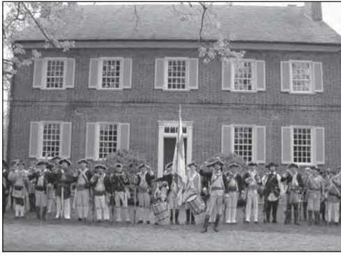
Historic Locust Grove, the venue for the “Interpreters and Historians” Working Group, is also home to 18th-century re-enactments.