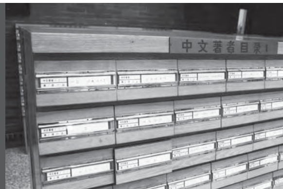
Library card catalogue at Tsinghua University in Beijing, China. Courtesy of Flickr.com user OzinOH. See http://creativecommons.org/licenses/by-sa/3.0/ for license terms of this work.

Bridge to Asia, the largest such program in China where it sends 500,000 books to 1000 universities per year, seeks your unwanted journals and books. Needs are urgent - even premier schools lack adequate collections. Thank you for helping if you can.