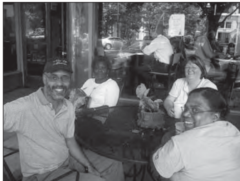
Institute participants having lunch at the former Kress 5 & 10 store that was a focus of civil rights protest in Columbia in the 1960s.

focuses on cultivating undergraduates who have an interest and aptitude for public history and encouraging them to pursue post-graduate education. Thus, someone who discovers public history as a sophomore in her studies at an historically black college might enter the profession five or six years later, after getting some experience in the field and completing a two-year Master of Arts program in public history.