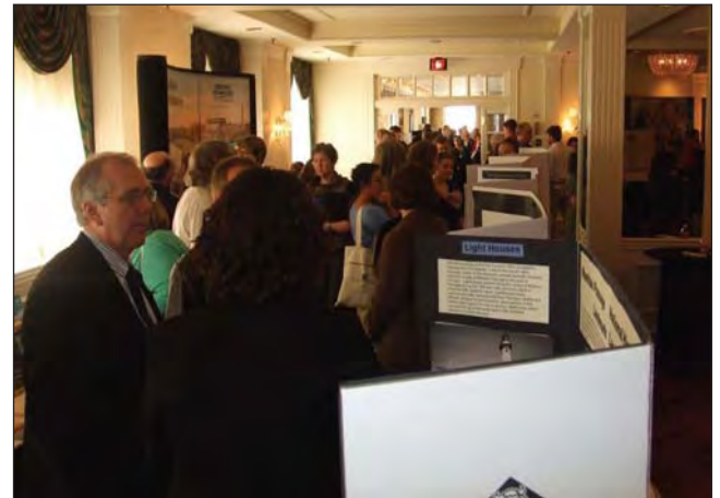
Attendees perusing projects at the Poster Session.