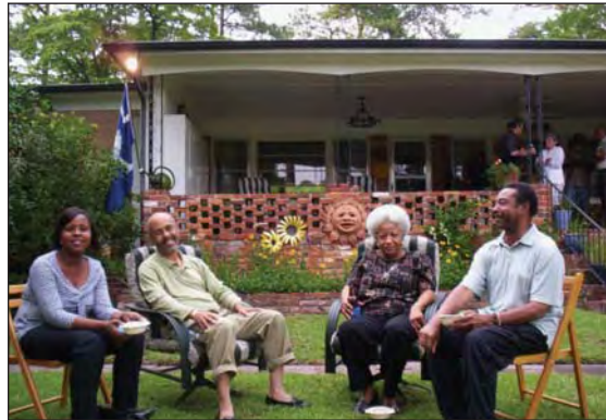
NEH summer institute participants at the opening reception on Spring Branch Pond, Columbia.