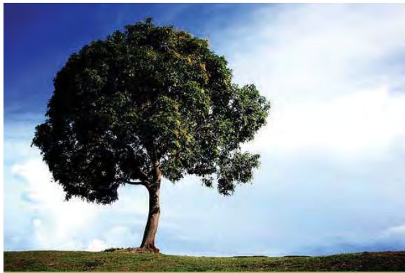
Courtesy of Flickr.com user bullish174. See http://creativecommons.org/licenses/by-sa/3.0/ for license terms of this work.