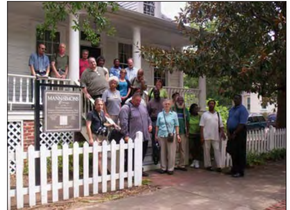
NEH summer institute participants at the Mann-Simons Cottage, a museum property of Historic Columbia Foundation.

To begin with a point of clarification, NEH Summer Institutes are geared toward teaching, not research, which is the province of the NEH Summer Seminar. Teaching, then, was our mandate and the primary goal of the onsite summer experience was helping college faculty learn how to teach public history in their undergraduate courses. For some time now the NCPH has become a forum for conversations—among individual members and as an organization—about whether the quality of public history training is keeping up with the admirable proliferation of public history programs in the United States. The rapid growth of public history within history departments