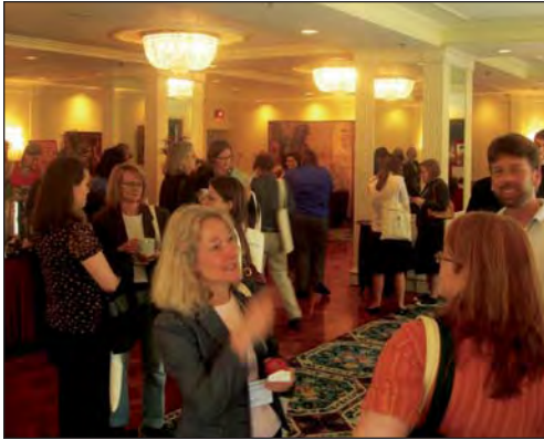
Coffee break in the exhibit hall.