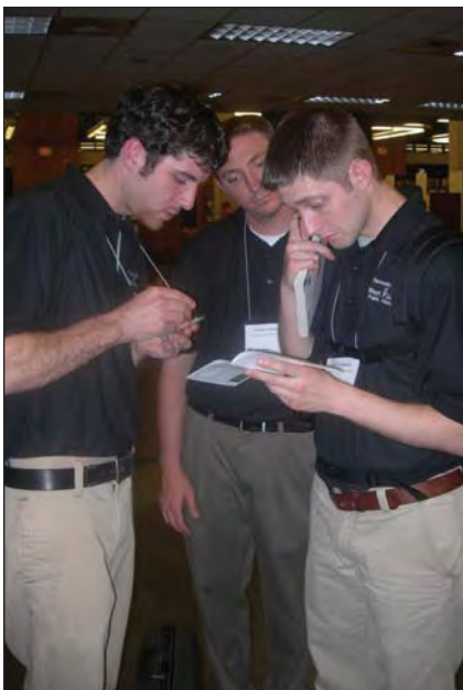
University of West Florida Students served as technology gurus for the duration of the conference.