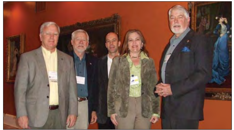
Conference attendees network before Sunday's Plenary.