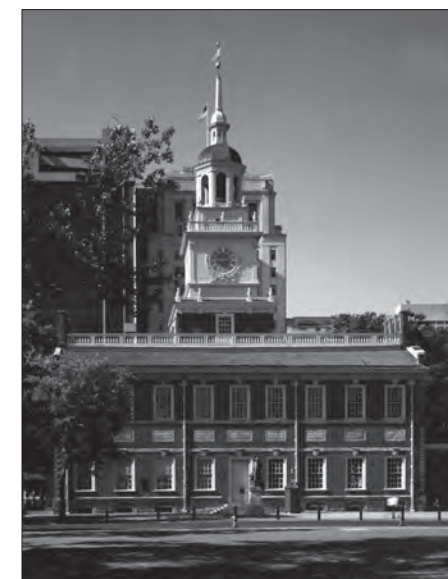
Independence Hall, one of the sites that TAH teachers will visit on the NCPH tour next year.

The U.S. Department of Education announced in June that its latest round of Teaching American History Grants includes a $1.5 million award to a consortium of Pennsylvania school districts partnering with NCPH and other educational and cultural organizations.