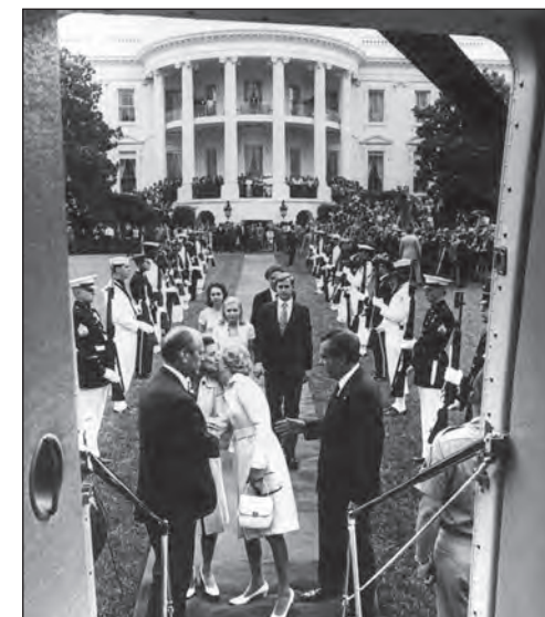
Richard Nixon departing the White House after resigning, August 9, 1974.