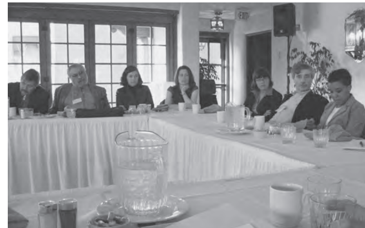
2008 Public History Educators' Breakfast in Santa Fe.

Over the past year, the Curriculum and Training Committee has had an ambitious charge, but our committee met the challenge.