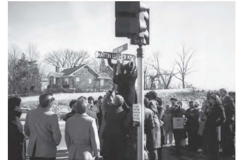
Renaming of Martin Luther King Drive, Frankfort, KY.

to explore early settlement, archaeological evidence of thriving river commerce, industrial impacts, and civil rights issues. By the end of the trail riders will have traveled through the story of Louisville and have gained an understanding of what makes this city tick. The pace will be moderate on flat terrain, and will cover 10 to 15 miles, with rest stops.