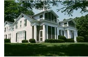
Veraestau Historic Site and Preservation Center