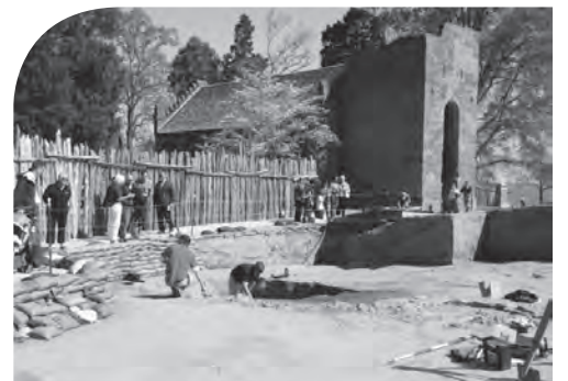
Jamestown, Virginia.

In case you are unaware of this situation, it happens all the time. Archaeologists have become the all-purpose employee, the Leatherman of CRM. Need an ethnologist? historian? Just let the archaeologist do it all. This is true in private consulting firms as well as state and federal agencies. I routinely see archaeologists doing everything from recording historic buildings, to conducting oral histories, to writing historical reports. While some of this work is