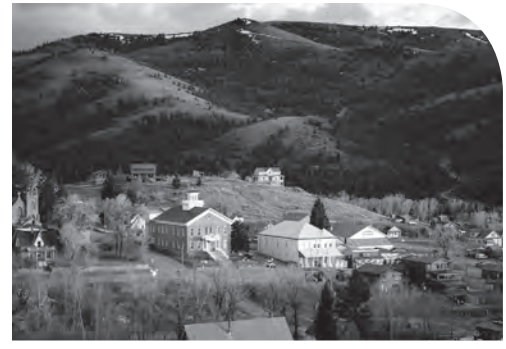
Contemporary photo of Virginia City, Montana.

The time is now for public history programs across the nation to begin incorporating the public history field school as an integral and required curricular component for undergraduate and graduate training. Immersing students into a historic setting, complete with staff professionals working to restore, curate, and interpret an existing historic facility, offers students instruction and experience that enriches their public history training and enhances their employment opportunities inside and outside the academy.