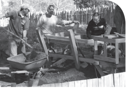
Jamestown, Virginia.

At the end of the day it is relevant to ask, what does the NCPH do for qualified professionals outside the favored environs of established consulting firms or academic scholars-as-contractors? Perhaps the NCPH is not well positioned to help, but perhaps the organization can broach how institutionalized exclusion from public history opportunities can be allayed to some extent. My correspondent's message cited challenges posed to public historians in cultural resource management (CRM), which I would specifically like to address.