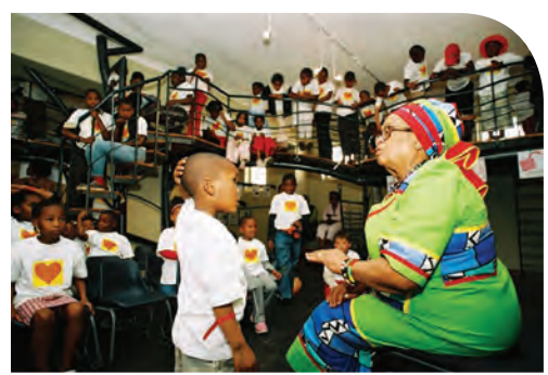
Consitution Hill, South Africa.

One morning ten years ago, I ran to my local bodega to grab as many Sunday New York Times as I could carry. The International Coalition of Sites of Conscience-a grand name for what was, at that point, an idea shared by nine people-was getting its first review as a serious venture. I was working at the Lower East Side Tenement Museum, using the stories of families from 20 different nations who once lived and worked at 97 Orchard Street, to foster dialogue across difference on the immigration questions our visitors were grappling with today. We offered English classes, inviting new immigrants to compare their experiences with those of their historic counterparts. We hosted "Kitchen Conversations", public dialogues on topics like, "Who is American?" and "What does it mean to be a citizen?" Our community didn't find this unusual; but our colleagues were deeply skeptical. Should a history museum raise questions about the present? We felt very much alone.