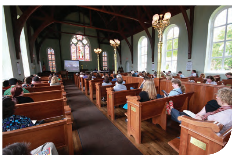
Session in Old Christ Church.