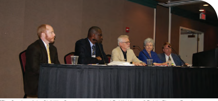
"The Coming of the Civil War Sesquicentennial and Public History" Public Plenary Panel