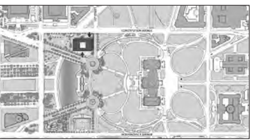
Proposed site of Smithsonian Latino Museum, west northwest of the U.S. Capitol.

was announced last year, the proposal to open the Mason-Dixon Gaming Resort a half-mile from Gettysburg National Military Park has drawn immense opposition—an April survey by a national polling and research firm found that only 17 percent of Pennsylvanians supported the idea, with 66 percent actively opposed and 57 percent indicating that such a facility would be "an embarrassment" to the Commonwealth. Last year nearly 300 American historians sent a letter to the Pennsylvania Gaming Control Board in opposition to a proposal to license the casino. Beyond the individual signatories, the NCPH, American Historical Association, National Coalition for History, Organization of American Historians, Society for Military History, and Southern Historical Association sent a separate letter of opposition to the Gaming Board.