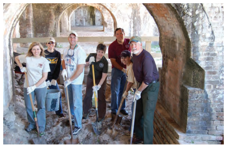
Service Project at Ft. Pickens.