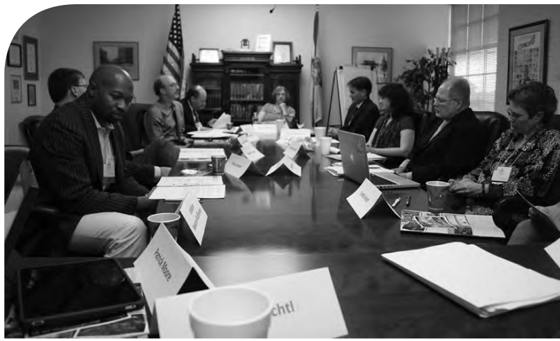
Executive Board Meeting in Pensacola

Between the Fall 2010 and the Spring 2011 and board meetings, the board took the following actions: