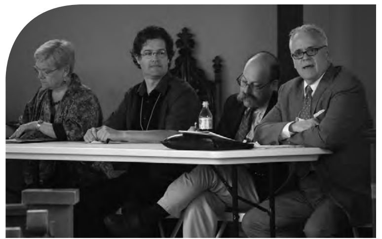
"Collecting the Material Culture of Difficult Subjects" Session.