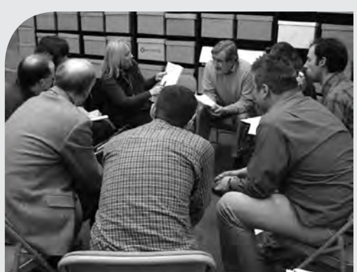
Participants in the "City of Brotherly Love" roundtable discuss topics for The Encyclopedia of Greater Philadelphia . More than sixty people attended this event at the Historical Society of Pennsylvania on March 23.

NCPH members are welcome to participate online at http://philadelphiaencyclopedia. org. The project is based at the Mid-