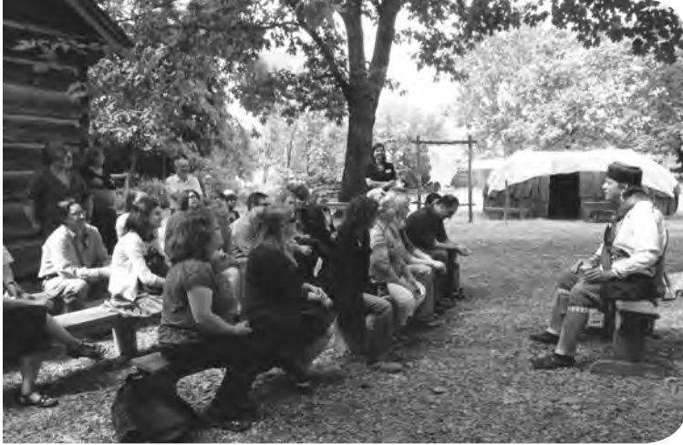
IUPUI Public History Program's annual Workshop attendees at Conner Prairie Interactive History Park, August 2013.

When I began my search for a graduate school to develop my skills as a public historian two years ago, the National Council on Public History's Guide to Public History Programs became a vital aid in helping me choose a program that was most appropriate to my needs and interests. This guide—sold as a print publication as late as 2006 but now accessible online to anyone—is an important resource for prospective students and public historians seeking a clear picture of the state of the field.