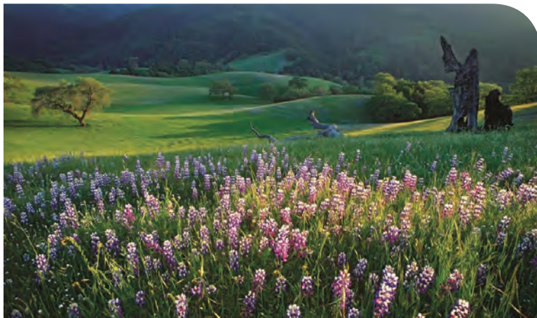
Monterey County CVB

In consideration of the growing evidence of climate change, one of the core questions our program asks is how we can use history to promote a better relationship with the environment. Sessions examine ways to engage public audiences with the history of land use, natural resource consumption, the politics of conservation, and energy use. Others identify potential venues for critical history including the local farm movement, public transportation systems, and heritage tourism. The conference supports a larger effort to become more environmentally responsible in preserving historic resources