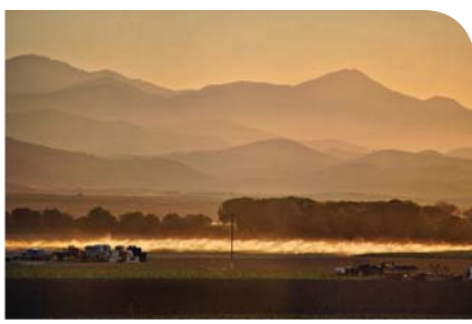
Salinas Valley.

Fourteen tours throughout the conference also provide chances to learn more about sustainability in public history. "Adaptive Reuse around Monterey Bay" looks at how Fort Ord—a de-commissioned U.S. Army base—was turned into a college campus and how parts of Monterey's historic fish canneries became a part of the Monterey Bay Aquarium. A tour led by Central Coast Lighthouse Keepers will guide participants through Point Sur Lighthouse and Point Sur State