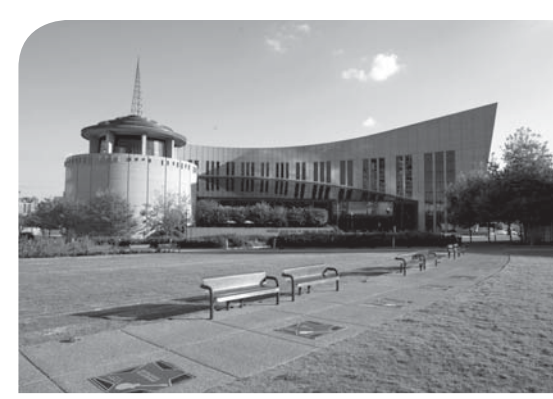
Country Music Hall of Fame.

organizing the annual Public History Educators Breakfast. Several topics for discussion at the breakfast are under consideration: ways to provide prospective students with questions they should be asking about public history programs; effective strategies for advocating for your program with university administrators; program evaluation; developing methods to encourage working with employers; strategies for ensuring high-quality internships; challenges of including applied projects in graduate courses; teaching digital history; and standards for non-traditional theses. The committee also has commented on the board's plan to invite other associations to join a task force to examine the state of public history training and employment today.