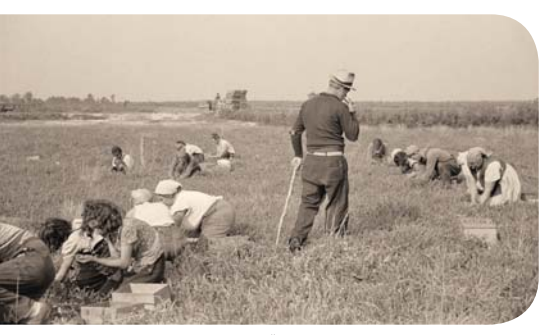
The Boot Camp's theme was "New Views on Immigration and Diversity for History Organizations." In this 1938 photo, a padrone supervises the work of Italian American cranberry pickers in New Jersey.

While large institutions like the Smithsonian Institution, Independence Hall, or Colonial Williamsburg have the funding and staff to experiment with and disseminate new ideas in exhibitions, interpretation, education, and public history, the vast majority of history organizations in the U.S. are too small to benefit from their work or to attempt their own. A 2009 report by the Mid-America Arts Alliance analyzed a survey of arts and history museums in six Midwestern states and found that 60% of the museums in that region had budgets less than $100,000. In New Jersey, where I have worked in public history for nearly a decade, the situation is starker. While there is no explicit data on this topic—though it is sorely needed anecdotal evidence suggests that most history organizations in the state employ a handful of people, at best, and more likely just one or two. Volunteers and board members fulfill critical functions that in other, better funded organizations would be done by employees, including historical interpretation, collections care, and fundraising.