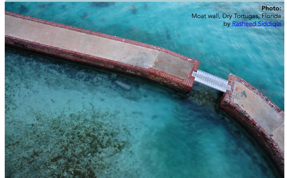
Moat wall, Dry Tortugas, Florida