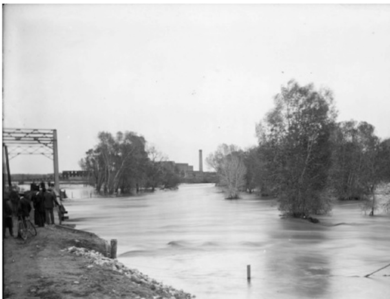
Photo: 1904 Flood on the Cache La Poudre River, Linden Street Bridge, Fort Collins, Colorado.

The " Ginibiiminaan " ("Our Water") poster by artist Wesley Ballinger features an image of a Great Lakes water-walker. Ballinger is a member of the Mille Lacs Band of Ojibwe of East Central Minnesota. The message of the poster focuses on protecting and caring for the water as the environment changes, but the images within it are not immediately recognizable to the average non-tribal person and require interpretation. The primary image central to the poster is a water-walker and her copper bucket. Over a period of several years, water walkers—women from the tribal community known as anish , or women keepers of the lake—did a series of traveling to make spiritual, personal and public statements about their connections to and concerns about the endangered waters in North America. The first one involved a group of elder women who walked around Lake Superior in Spring of 2003, then around Lake Michigan in 2004, following by Lake Huron in 2005, Lake Ontario in 2006 and Lake Erie in 2007. A return water walk