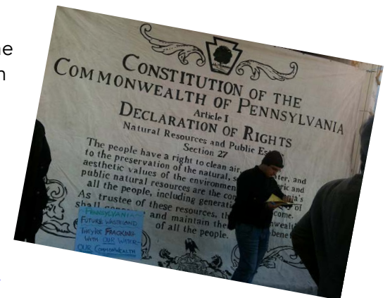
Photo: A 2010 action by Marcellus Protest invokes the Pennsylvania Constitution.