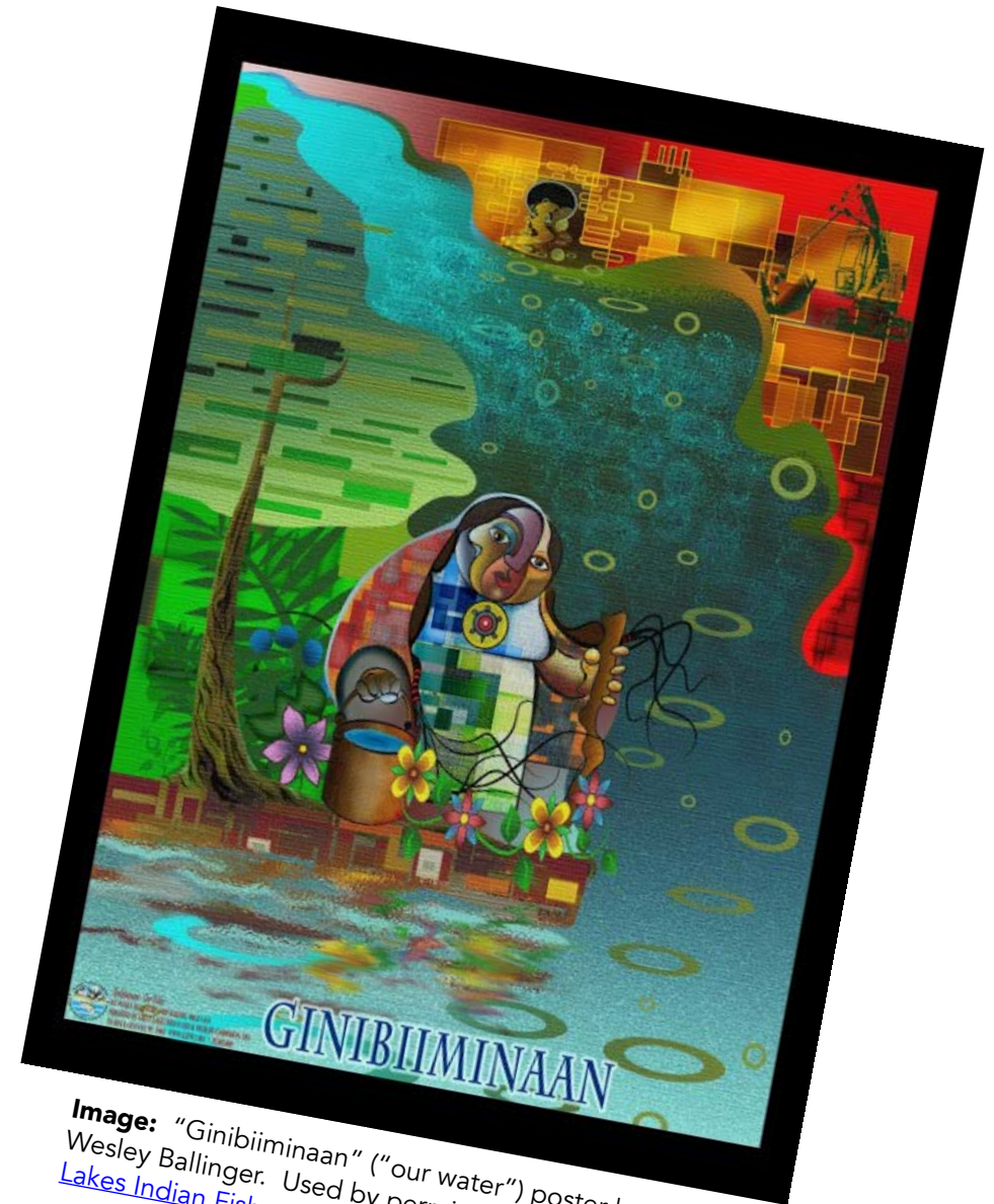
Image: “Ginibiiminaan” (“our water”) poster by Wesley Ballinger.

For the Indigenous people of this region, what does this scientific data mean, and how does it manifest itself in their everyday lives and their concerns about their future and that of their descendants? Just as importantly, what do (and can) they do to change this? Water walks by women elders who sing songs to and for the water while they travel, and at the same time continue important cultural traditions while reminding both tribal and non-tribal people about this increasingly