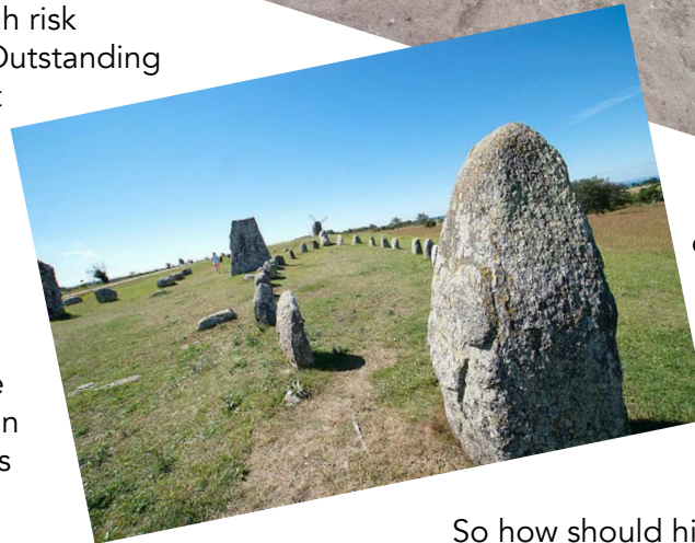
Bay off of