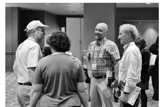
Attendees reconnected and met new faces.