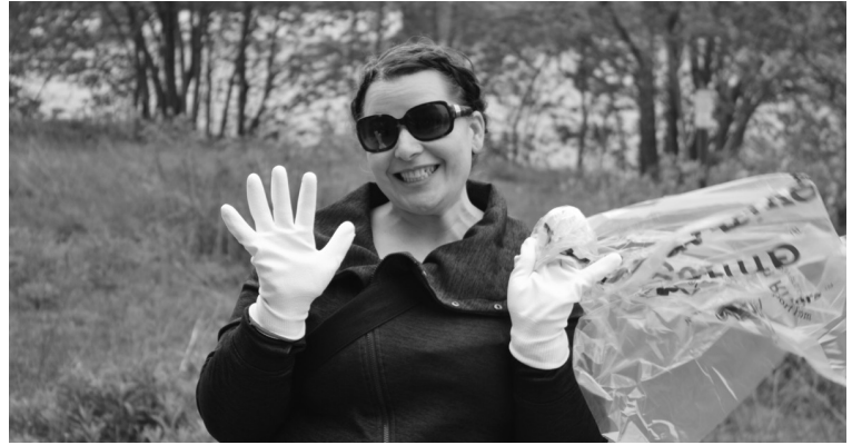
The Environmental Sustainability Committee gave attendees the chance to learn about the White River's history, clean up its banks, and have fun in the process!

Our long-running listserv, H-Public, is now virtually inactive. After consulting with the NCPH Board of Directors, the DMG has decided to step back from the list after editing it for many years. While listservs still serve a purpose in today's changed media environment, the specific role that H-Public was intended to fill—creating a space for digital dialogue among public historians—has long since moved elsewhere. We will wrap up our involvement in the list as of June 30, 2017.