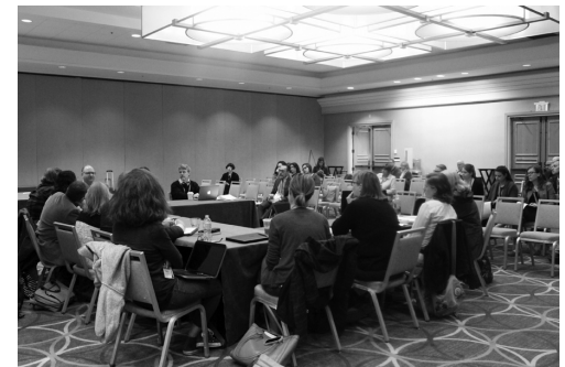
Working group discussants talked over the economics and ethics of internships.