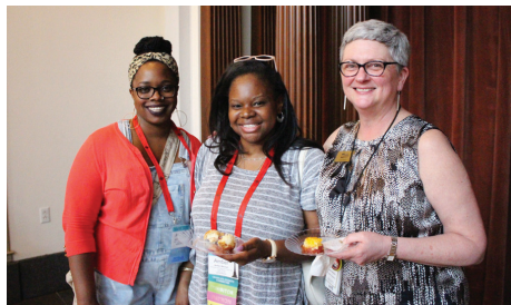
Attendees of the 2017 NCPH Annual Meeting had fun exploring the Indiana Historical Society afterhours at the Opening Reception.

April 19-22, 2017, NCPH welcomed over eight hundred public historians to Indianapolis, Indiana (home of the NCPH executive office!) for our 39th annual meeting. This year's conference theme, "The Middle: Where did we come from? Where are we going?" asked presenters and attendees to take stock of their work as public historians and consider the field's next steps and challenges. This turned out to be prescient at a time of significant nationwide political and cultural changes, giving attendees much to talk about.