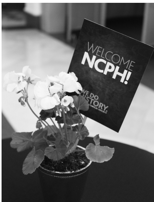
2017 NCPH Annual Meeting attendees got to explore the Indiana Historical Society at the Opening Reception.