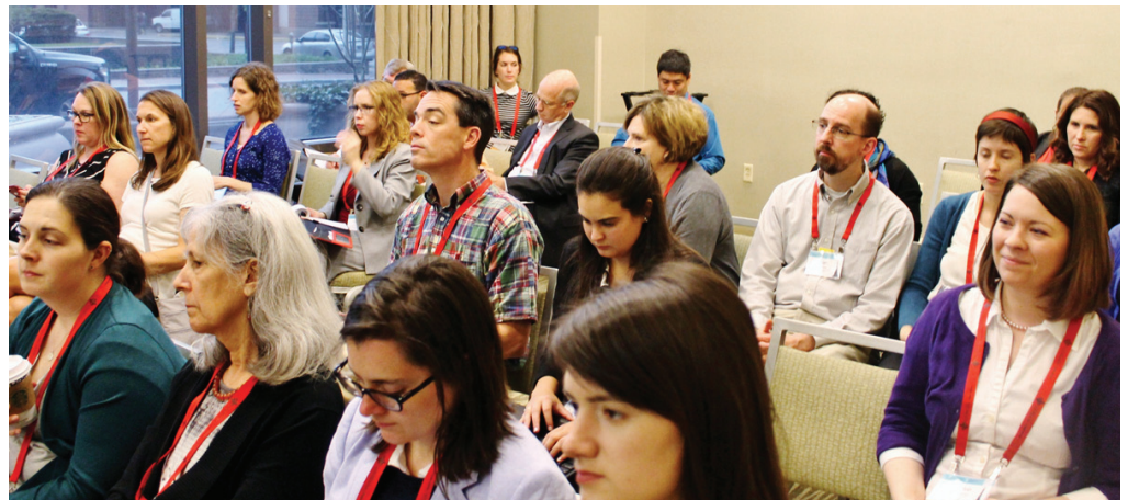
At S18, attendees learned about using new digital sources to reveal hidden primary sources.