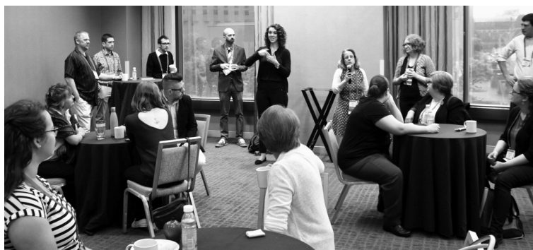
The Membership Committee welcomed new members to the NCPH family.

A number Membership Committee members were able to be in Indy for the annual meeting. The conference was a wonderful opportunity to reenergize as a committee while meeting new and returning NCPH members. During the conference we helped organize the Résumé Review Workshop, the First Time Attendee and Mentoring Connection Meet-Up, and the New Member Welcome. The committee was pleased to see such a great turnout at these events and looks forward to continuing to explore ways to make the NCPH meeting a welcoming space.