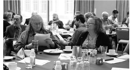
Educators took time to reflect on the current state of academic training.

what we know of the current and future job market, all hint at a profession which increasingly demands that its practitioners turn an outward face toward the general public to make a case for history.