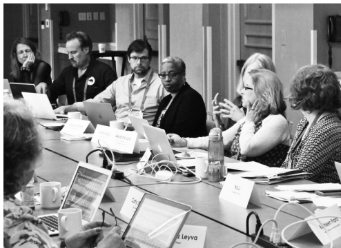
Board Members took time out of the Annual Meeting to plan for the future of NCPH.

After the October 21 and 22 meeting of the NCPH Board of Directors in Indianapolis, IN, and prior to the spring meeting in Indianapolis, IN, the board convened electronically and by telephone and took the following actions: