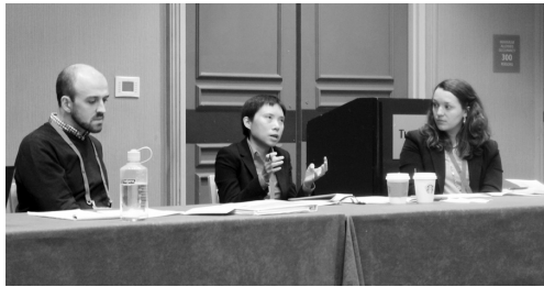
Panel discussion during the Moving Beyond the National working group.