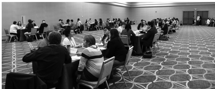
Grad students and new professionals connected with established practitioners at the Professional Development Committee's popular Speed Networking event.

We also hosted a successful mixer at the NCPH conference in Indianapolis. We greatly enjoyed meeting so many folks. We look forward to our next mixer in Las Vegas! Register early because our