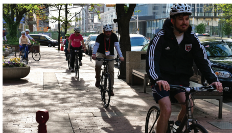
The Historic Downtown Indy Bike Tour took participants to cultural districts and monuments on two wheels.

We were excited to have the chance to highlight some of our fantastic local partners and their exceptional public history work.