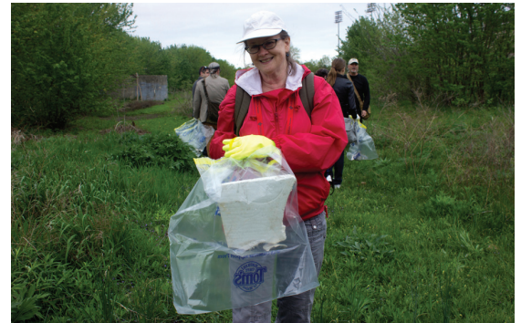
Participants on The Environmental History of an Urban River service tour, helped a local nonprofit clean up the banks of Indy's White River.