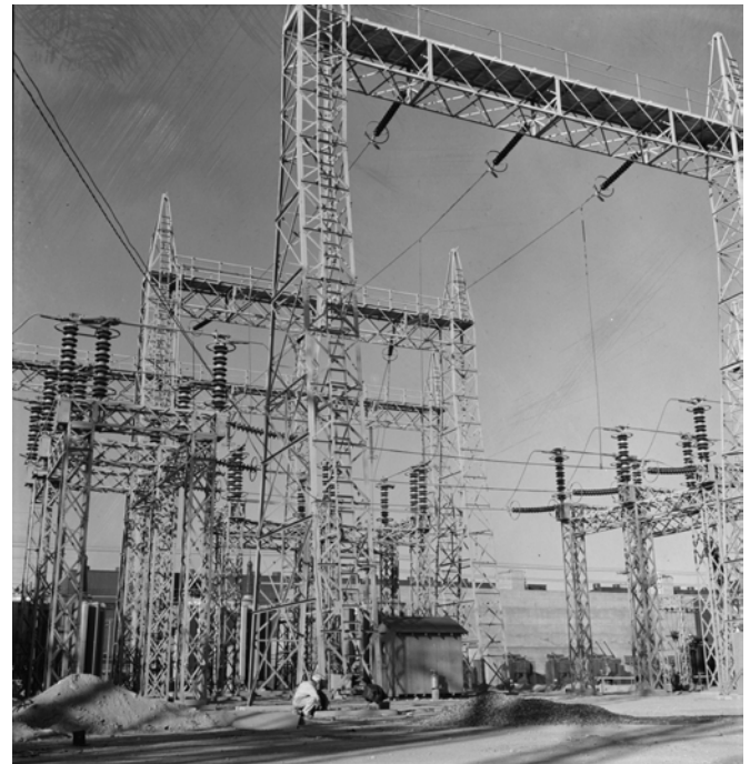
Transmission towers redistributing power from Boulder Dam to Basic Magnesium Incorporated near Las Vegas, 1942.