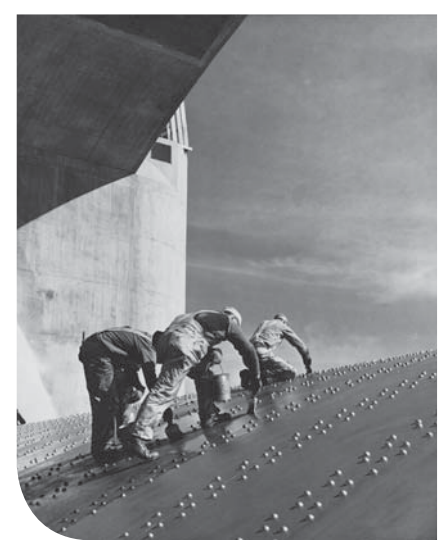
Painting a spillway on the Hoover Dam, c.1940.

September. TwHP indexes its lessons by states, themes, time periods, learning skills, and national history and social studies curriculum standards. Lesson plans increasingly have incorporated service learning into activities, reinforcing student learning and encouraging civic engagement in communities. TwHP is one of the National Park Service's life-long learning offerings and provides links to Discover Our Shared Heritage travel itineraries, Teaching with Museum Collections, the National Register of Historic Places, and other sites.