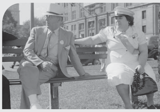
Delegates at the 1939 Letter Carriers Convention in Milwaukee, WI.

More than six hundred public historians and another two thousand registrants through the Organization of American Historian are expected to attend the 2012 NCPH/OAH joint Annual Meeting in Milwaukee, Wisconsin. NCPH invites you to raise your institution's, company's, organization's, or office's profile by reserving exhibit space or sponsoring an event. These are effective ways to reach potential customers, partners, or students; promote the latest