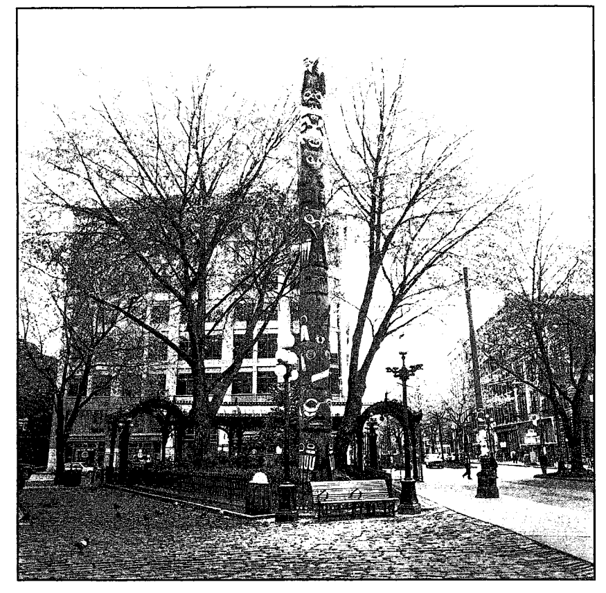
Seattle's original city center is Pioneer Square, currently a historic district housing galleries, restaurants and retail shops.

Seattle is home to many cultural and educational facilities and institutions. The