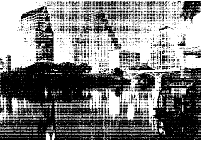
A view of the Austin skyline as it sits over Town Lake (the Colorado River).

Hundreds of public historians are expected to travel to the seat of Texas State government in April. With a theme pertaining to the international, multicultural, and interdisciplinary practice of public history, the Program and Local Arrangements Committees have prepared a meeting that promises to be very lively, one filled with stimulating sessions and a variety of public history-related extracurricular activities.