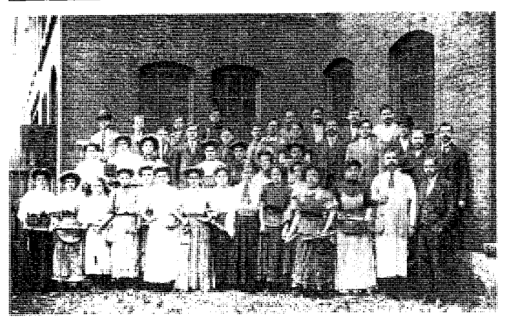
Weave Room Workers, Boott Cotton Mills, Lowell, AIA, circa 1910.