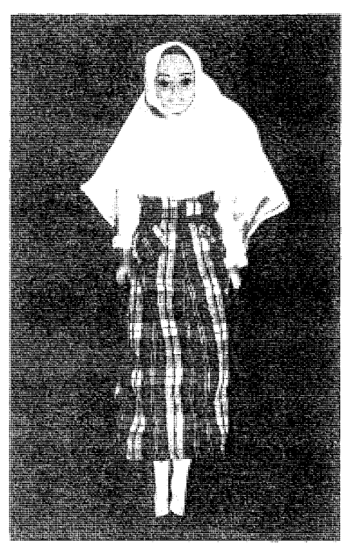
Ruzanne the Muslim Doll, promoted as the "Muslim Barbie"

To move beyond this surface level for September 11th collecting, Global Communities' staff developed a modest oral history plan. The Global Communities' web site (http://www.chicagohistory/immigration.html) proved an ideal outlet for these oral histories, offering a space where a few edited transcripts would appear. As an acknowledgement of the importance of Islamic culture in Chicago, the month of Ramadan (November 2001) was chosen for the transcripts' debut on the project site. Posting the transcripts within roughly two months of the attacks was also meant to add to the growing national dialogue on September 11th and its meanings. While these decisions were rather easy, selecting Muslim Americans to be interviewed proved much more difficult.