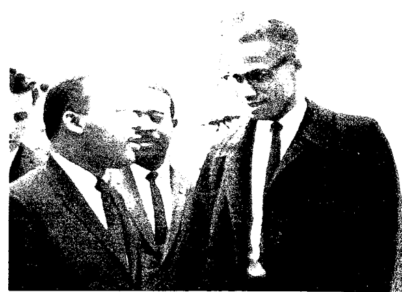
Martin Luther King, Jr., pictured here with Malcolm X, is the centerpiece of the author's leadership case study on "Communication and Dealing with Opponents, Rivals, and Enemies."

Most people love to talk about themselves. The reason is obvious: they value their own experiences. More than that, though, is the way in which they tend to talk about themselves. They formulate their experiences into stories. It is the story format that is central to my work at Historical Solutions LLC. I present history as a set of stories. By story I don't mean fabrication; I'm referring to something with a beginning, middle, and end, with each stage powered by the drama of real life. People will embrace history if it comes to them in story form. I've also noticed that many adults are interested in their