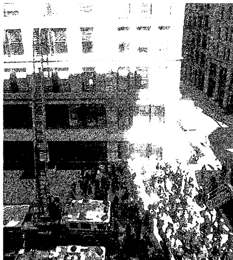
On the anniversary of the terrible 1911 Triangle Shirtwaist fire, NYC garment unions still gather to keep the memory alive.

People also value places that support forms of community life. These can be informal and formal gathering spots, economic anchors, or symbols of history and identity. They may or may not resonate beyond their immediate community, but their loss can provoke deep mourning and in some cases real consequences for that community’s well being. The ethnic social club Bohemian Hall in Astoria, Queens, is this kind of spot. For over a century it has supported the cultural and social life of Czech-New Yorkers—hosting traditional Sokol gymnastics, for example—and is now the last of its breed. Threatened with bankruptcy, its supporters realized that