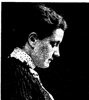
Jane Addams is the historical figure in focus for the case study on "Organizing Tasks and Staff for a Vision."

Almost three years later, Historical Solutions LLC has proven viable, even profitable. The initial offering of five historical case studies has grown to more than twenty. The focus on leadership broadened into new services for strategic planning and emergency management. A target client group has emerged—healthcare. The client list includes numerous repeat customers, some of whom have engaged my service for entire management teams and departments. The roster of my participants now features more than four hundred "alumni." Existing