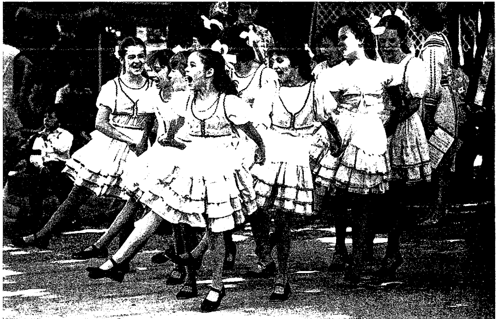
Bohemian Hall's gracious, enclosed plaza hosts NYC's last beer garden and the cultural activities of its Czech founders and other ethnic groups.

Place Matters looks at New York as a treasure-house of sites that are assets in all kinds of human and community development. Yet the role of place in promoting historical memory and public life is often undervalued. Our aim is to