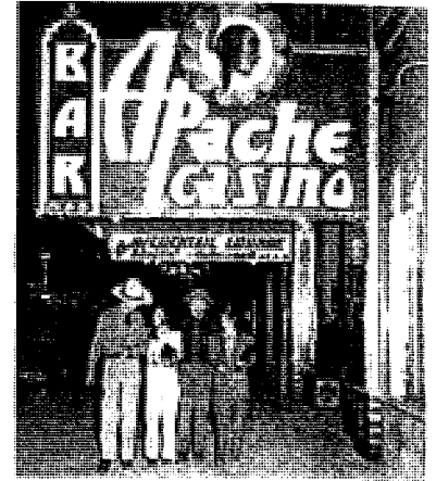
Main Street, Las Vegas, Nevada, 1940.