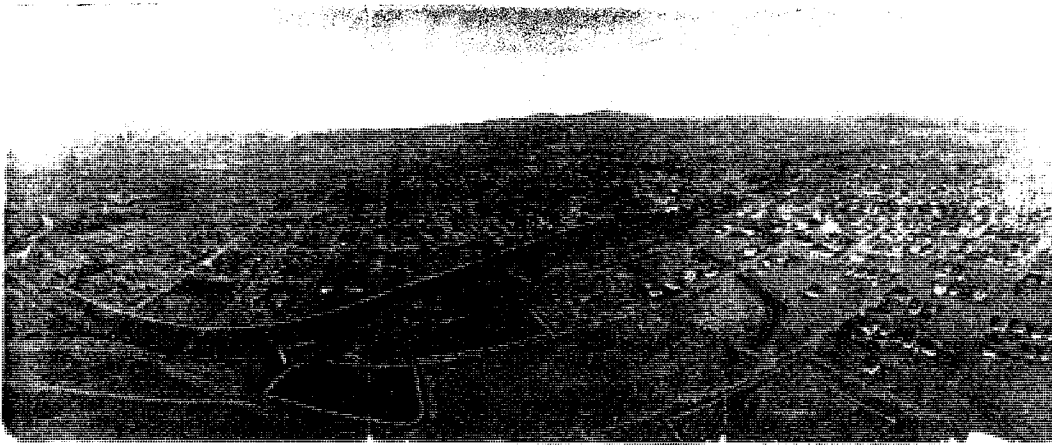
Panoramic view of Reno, Nevada. 1908