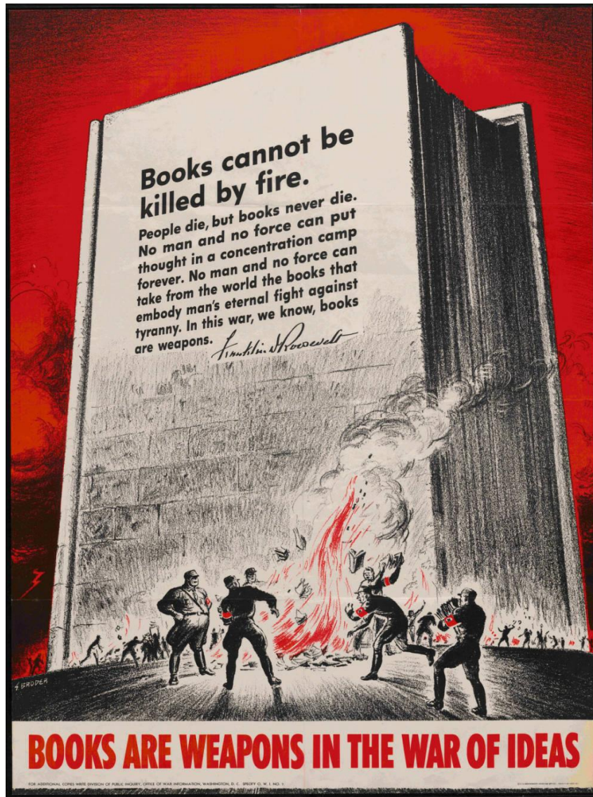
Figure 1: This 1942 poster printed by the US Government Printing Office includes a quote from President Roosevelt. The caption, “Books are Weapons in the War of Ideas,” emphasizes Americans’ belief that the war was one focused on defeating principles of fascism, not just the countries that made up the Axis Powers.

Donovan and Roosevelt created the Interdepartmental Committee for the Acquisition of Foreign Publications (IDC) as part of the OSS. To do so, Donovan worked with Librarian of Congress Archibald MacLeish. MacLeish and Donovan knew librarians' research abilities could help find useful information. The IDC recruited its librarians from major institutions across the US. Beginning in 1942, these librarian-spies traveled abroad to establish outposts. IDC librarians worked across Europe, Africa, and Asia . 7