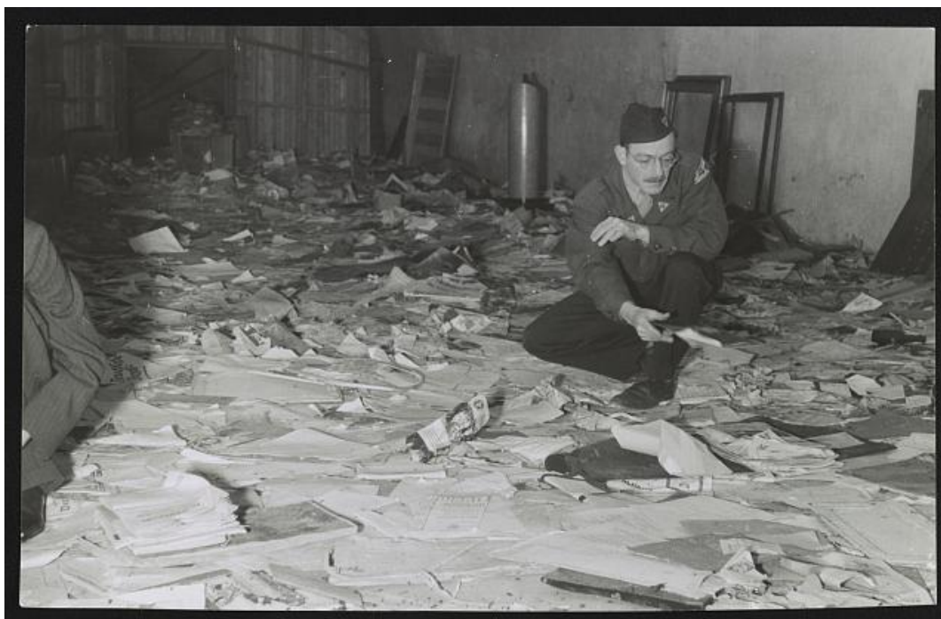
Figure 2 :As part of a 1946 mission to Europe, OSS agents sorted the remains of collections hidden across Europe and archived them for redistribution. Here, a Librarian of Congress sorts through the remains of a collection of documents held in the basement of a Munich Beerhall.