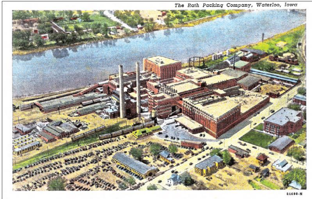
Figure 7: Aerial of the Rath Meatpacking Company, as a postcard.