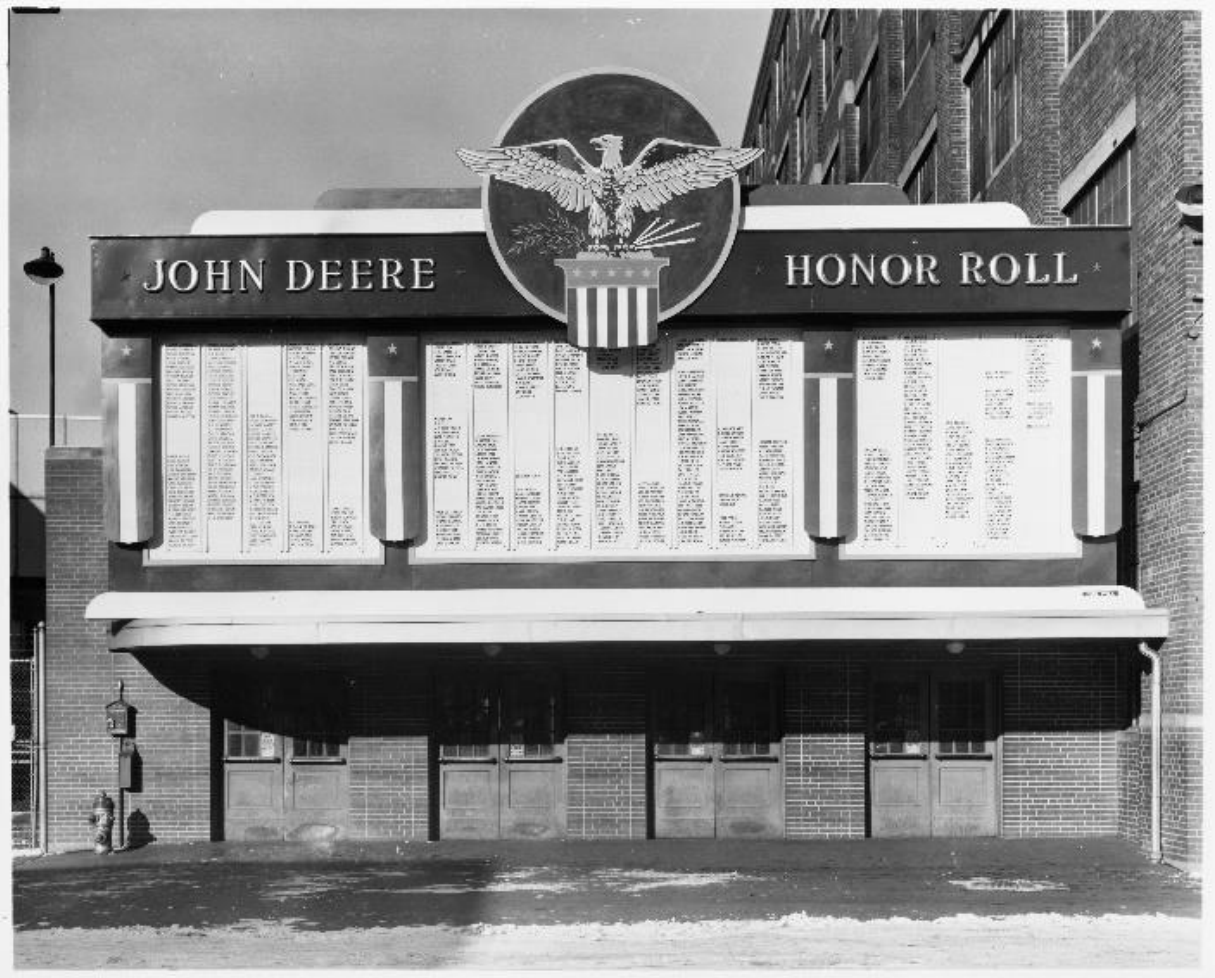
Figure 4: The John Deere “Honor Roll” in Waterloo at the Tractor Works. The sign listed all active employees serving in the war.