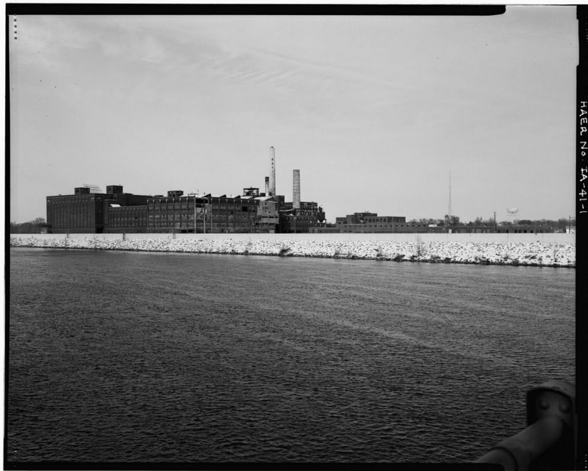
Figure 19: Rath Packing Company, date unknown, Waterloo, Iowa.