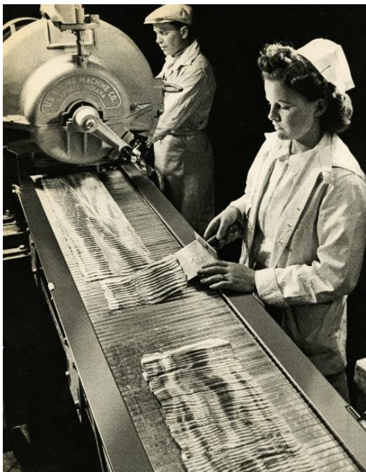
Figure 6: "Waterloo Packer." A female Rath worker, alongside a male, packing sliced bacon in 1941.