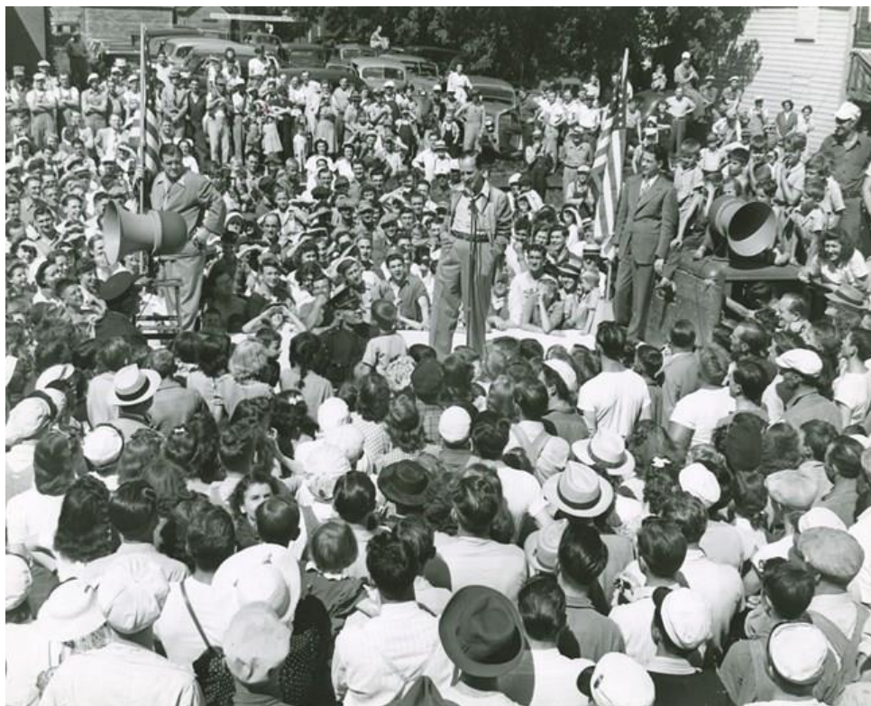
Figure 20: War bond rally in Waterloo on August 3, 1942, with American comedy duo Abbott and Costello.