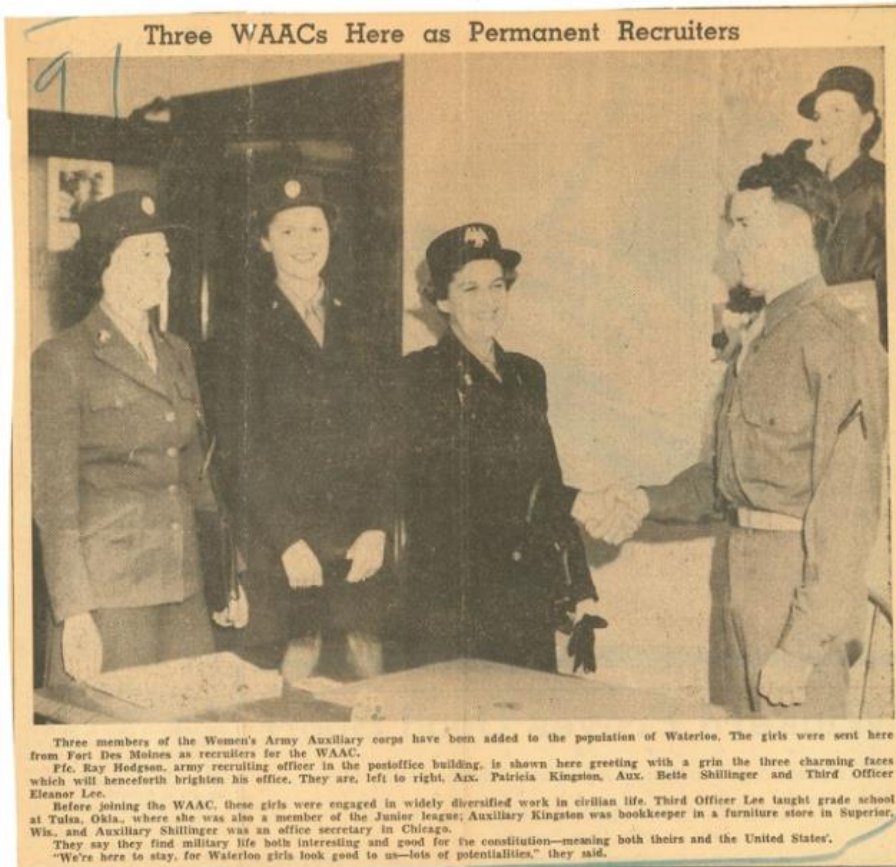
Figure 10: A newspaper image shows three members of the Women's Army Auxiliary corps pictured in the Waterloo post office building, who were assigned to Waterloo from Fort Des Moines. They are quoted saying, "We're here to stay, for Waterloo girls look good to us—lots of potentialities."