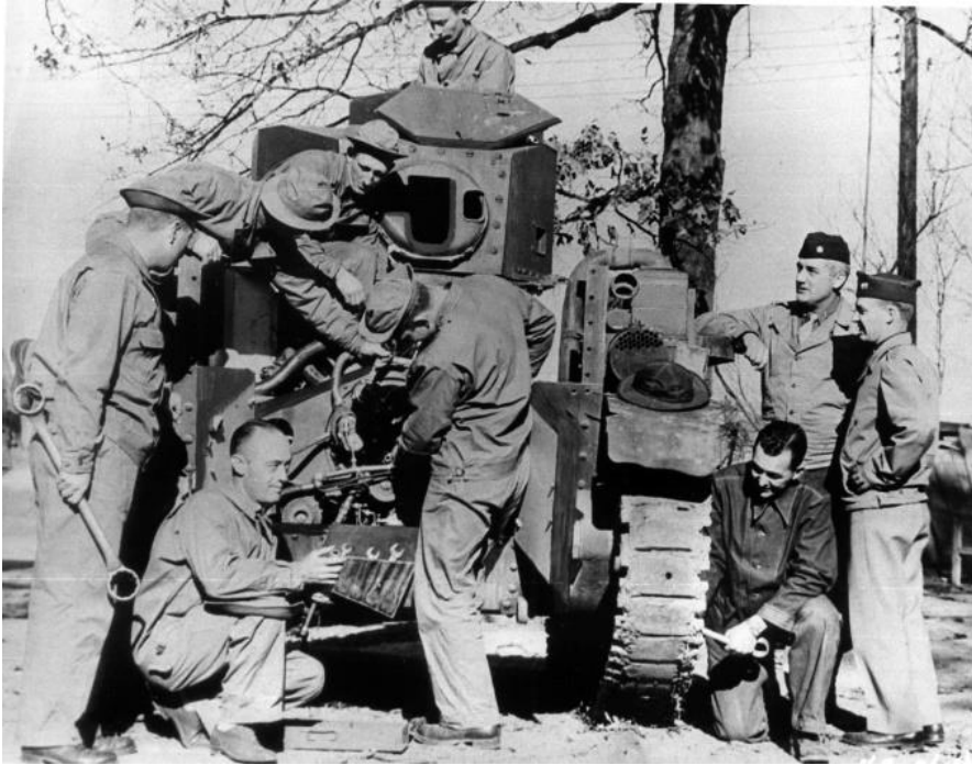
Figure 2: John Deere Battalion members repairing a tank, 1943