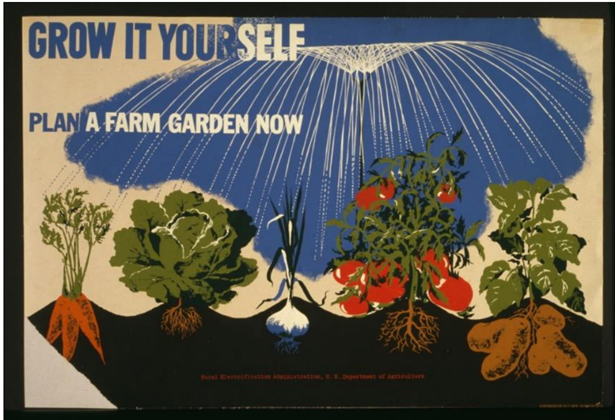
Figure 21: "Grow it yourself. Plan a farm garden now." This poster is an example of a wartime poster by the US Dept. Of Agriculture to encourage victory gardens, like those grown in Waterloo.