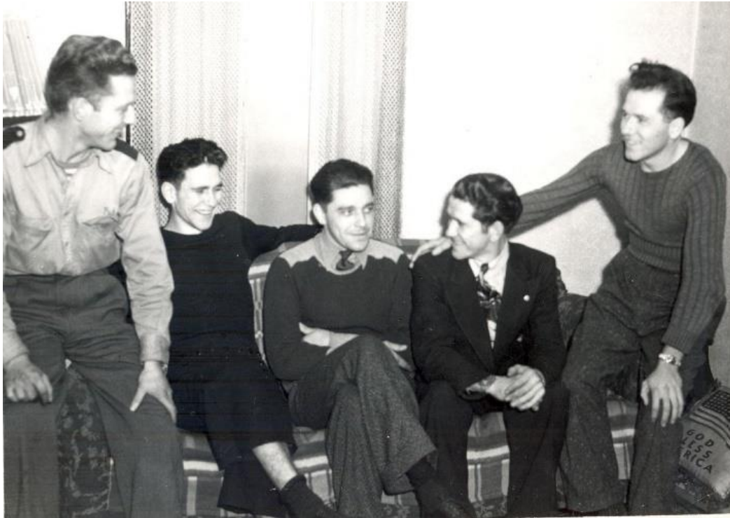
Figure 13: The five Sullivan brothers at home