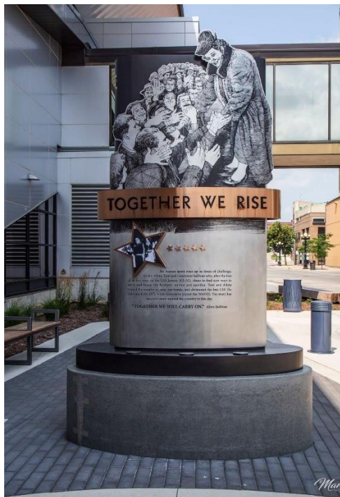
Figure 18: One of the signs in Sullivan Brothers Plaza. It highlights Alleta Sullivan on the home front after the loss of her sons, showing the picture from the Waterloo Sunday Courier, February 14, 1943