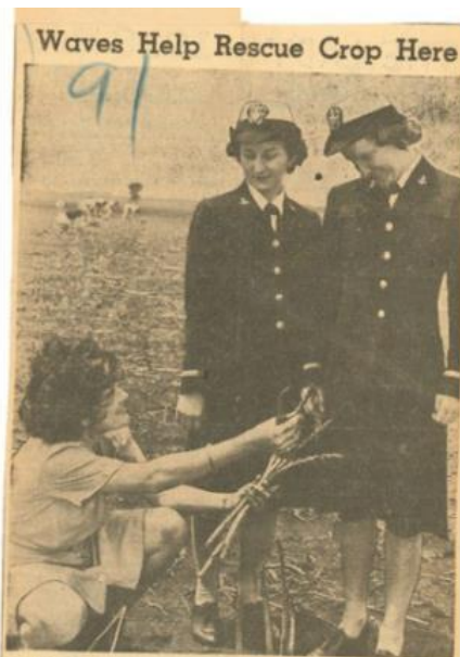
Figure 11: “Waves Help Rescue Crop here.” A newspaper image shows WAVES working at Prosperity Farms, east of Waterloo. 75 WAVES worked there that day; the previous week over 200 WAVES assisted at the farm, sent from Cedar Falls. May 21, 1944.