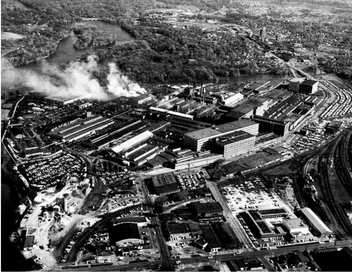
Figure 1: Aerial photo of John Deere Company factory in Waterloo, Iowa, directly after World War II, approximately 1950

A series of lessons from the World War II Heritage Cities Lesson Collection