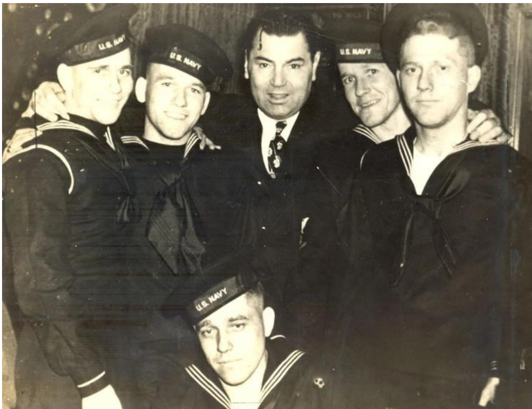
Figure 14: The Sullivan brothers with heavyweight boxing champion, Jack Dempsey. They were celebrated at his restaurant in New York City.