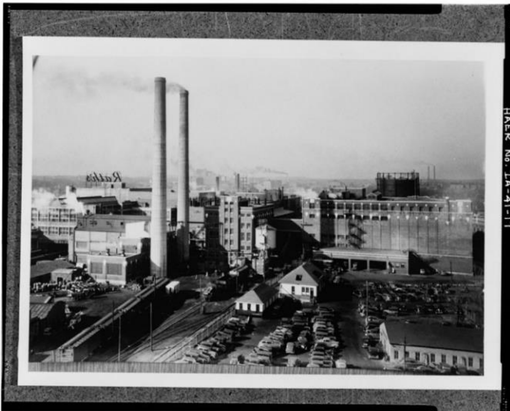
Figure 8: Rath Packing Company buildings; approximately 1937.