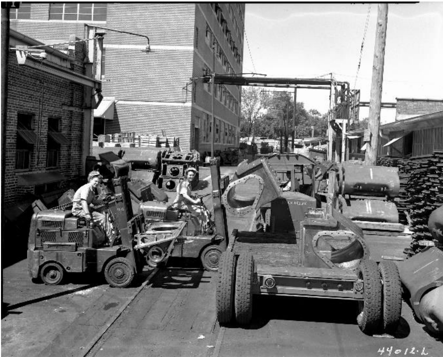
Figure 3: Women working at the Iowa Transmission Company, July 6, 1944.